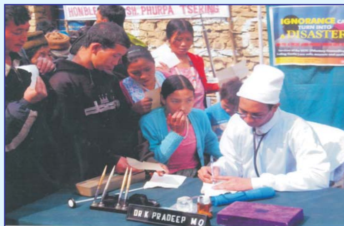
MEDICAL OFFICER EXAMINING PATIENTS

specialists from the Districts of Kokrajhar and Chirang rendered assistance by providing free medical services for the said Camp.